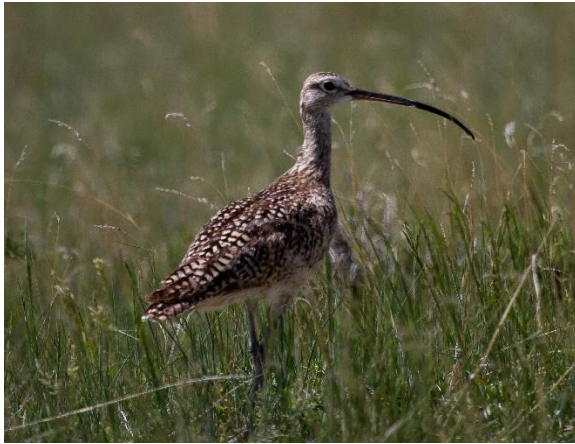
Long-billed Curlew

Grasslands, coulees and riparian areas meet in Writing-on-Stone Provincial Park (WOSPP), creating a great diversity of habitats for wildlife. At least 13 species of fish, 4 species of amphibians, 3 species of reptiles, 30 species of mammals and more than 160 species of birds have been recorded within the park. The count area includes WOSPP; Crow Indian, Verdigris and Pakowki Lakes; Pinhorn provincial grazing reserve; Manyberries, Ketchum and Canal Creeks; and remote areas along the Milk River. The headquarters for the 2024 count will be WOSPP.