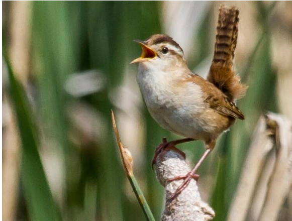
Photo: Marsh Wren

Lake Newell, Brooks and the surrounding area feature diverse prairie grassland plant life, irrigated farmlands, and many (245+) species of birds such as Burrowing Owl, Black-necked Stilt, Grasshopper and Baird's Sparrow, Ferruginous Hawk, Long-billed Curlew, an abundance of spring warblers in riparian areas, and animals such as: Pronghorn Antelope, Prairie Rattlesnake, Great Plains Toad and many more.